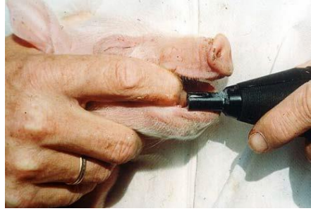
Hold the piglet like this

Piglet canine teeth may be ground within the first 4 days of life, provided there is evidence of injury to the sow's udder or litter mates' heads, incl. ears, which can be attributed to sharp teeth. Only people with proper training and experience are allowed to perform the procedure ( BEK no. 17, 2016 ).